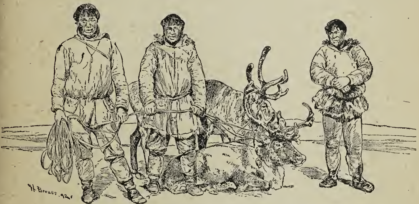
Siberian deermen brought to Alaska with the first herd.

In the first place, the population, which is now upon the verge of starvation, will be furnished with a permanent, regular, and abundant supply of food. As has already been stated the native supply of food in that region has been destroyed by the industries of the white men. (Appendix K.) The whale and the walrus that once teemed in their waters and furnished over half their food supply, have been killed or driven off by the persistent hunting of the whalers. The wild reindeer (caribou) and fur-bearing animals of the land, which also furnished them food and clothing, are largely being destroyed by the deadly breech-loading firearm. It will be impossible to restock their waters with whale and walrus in the same way that we restock rivers with a fresh supply of fish. But what we can not do in the way of giving them their former food, we can, through the introduction of the domestic reindeer, provide a new food supply.